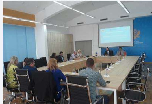
Study visit of members of the project advisory board (PAB) to institutions in Montenegro April 24 – 27, 2018

In 2018, the following activities were implemented: