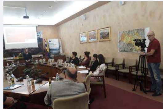
Info session Hate crime and hate speech in BiH , held in Jablanica, May 22, 2018

In addition to these activities, ADI staff actively participated at conferences, trainings and other educational activities organized by partner organizations and members of the Coalition for the fight against hate crime and hate speech in 2018, as well as at 7 coordination meetings related to the monitoring of life conditions of migrants and refugees in BiH organized by the UNHCR and the IOM.