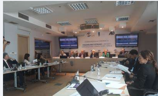
Regional conference Financial Investigations in Serbia, Bosnia and Herzegovina and Montenegro held in Podgorica, October 23-24, 2018

The final event of the project was held in Podgorica in October 2018. Over 30 representatives of courts and prosecutors from BiH, Montenegro and Serbia discussed the current challenges and new practices in financial investigations, negative and positive experiences, as well as the possibilities of cross-border cooperation between institutions in the region and Europe. In addition, the authors of the study presented their findings and conclusions, which was followed by a discussion.