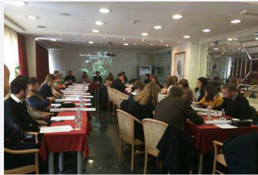
Roundtable Hate crime and hate speech in BiH, held in Sarajevo, December 17, 2018