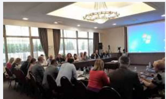
Seminar Financial investigations in cases of criminal offenses of money laundering held in Belgrade, July 10-11, 2018

Part of the activities of this project were realized in 2017, when a national meeting in Sarajevo was held, with 14 participants and a round table with 25