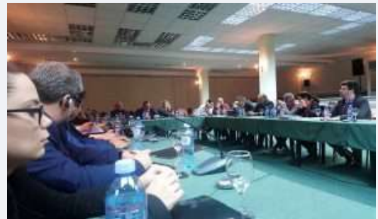
Balkan Regional Network for the Rule of Law (BRRLN) meeting, Ohrid, April 13-15, 2018

In the period from April 13-15, 2018 representative of the Association for Democratic Initiatives (ADI) Sarajevo participated at the meeting of the Balkan Regional Rule of Law Network (BRRLN) in Ohrid. The meeting was organized by the American Bar Association, the Rule of Law Initiative (ABA ROLI). The participants of the meeting were representatives of the bar associations of Macedonia, Albania, Kosovo and Bosnia and Herzegovina, representatives of NGOs and members of the Balkan Regional Rule of Law Network (BRRLN). This meeting was a continuation of the Network's activities during 2018, as well as project activities of the working groups of the member states. Also, representatives of ABA ROLI presented the E-learning platform ( http://www.brrln.org/e-learning/ ), the BRRLN website ( www.brrln.org ), after which participants discussed the possibilities of improving the platform's functionality.